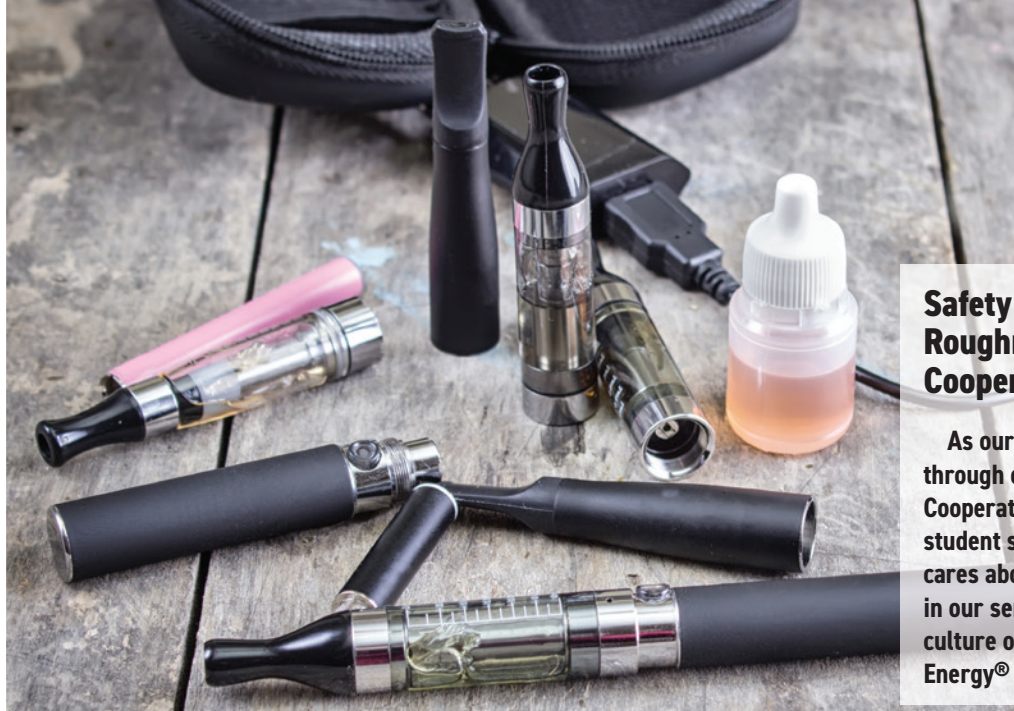
One of the many vaping kits on the market.